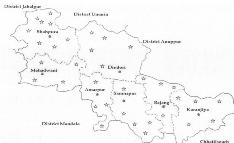
Map of Dindori Forest Division (M.P.) showing surveyed areas in various ranges.