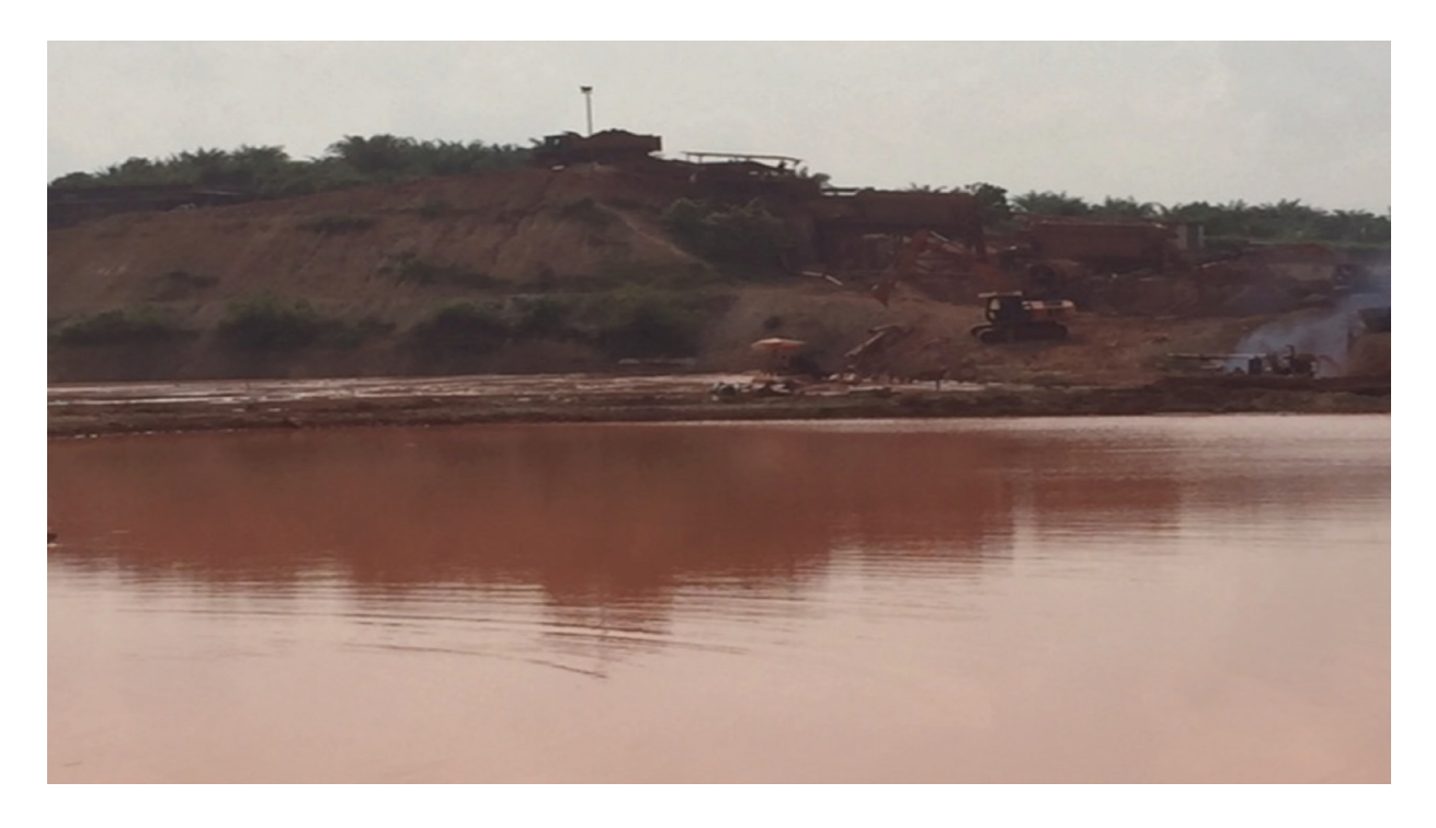
Figure 6: Bauxite washing pond showing "red water"

Malays J Med Sci. May-Jun 2016; 23(3): 1-8