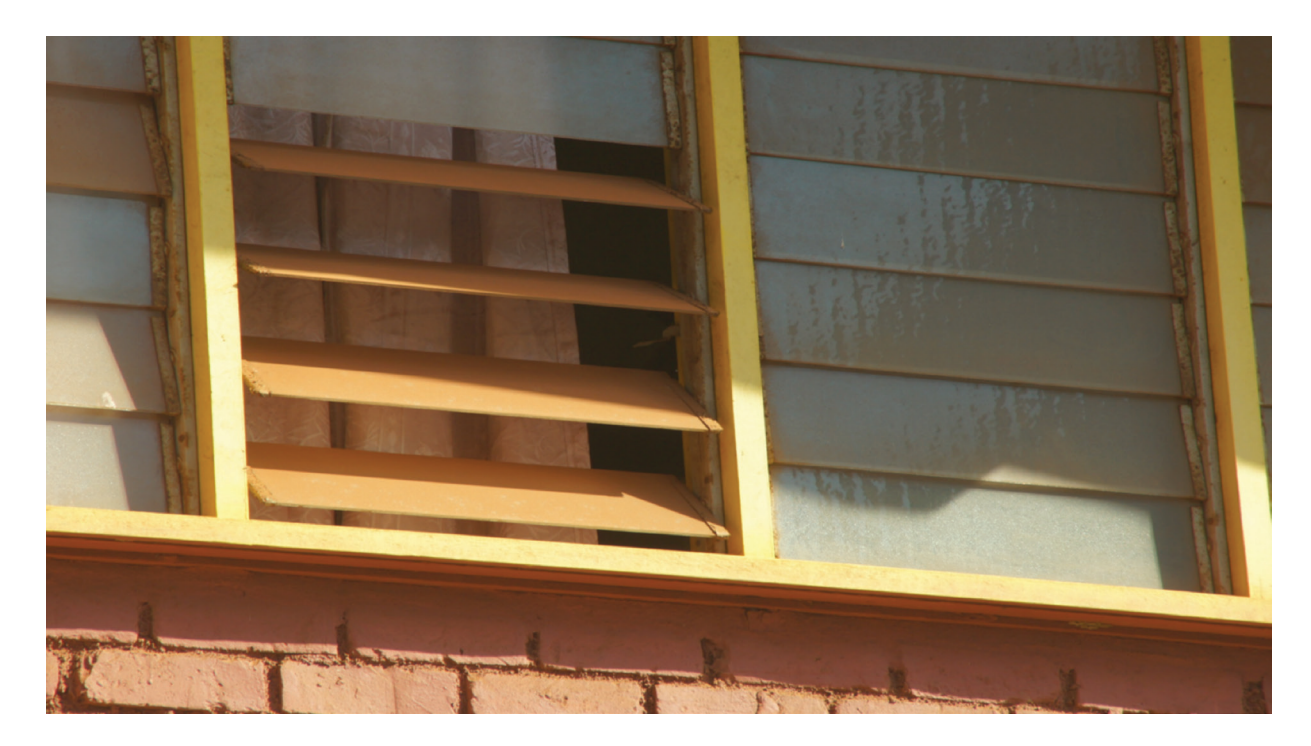
Figure 4: Red dust deposited on window of quarter next to Kuantan Port