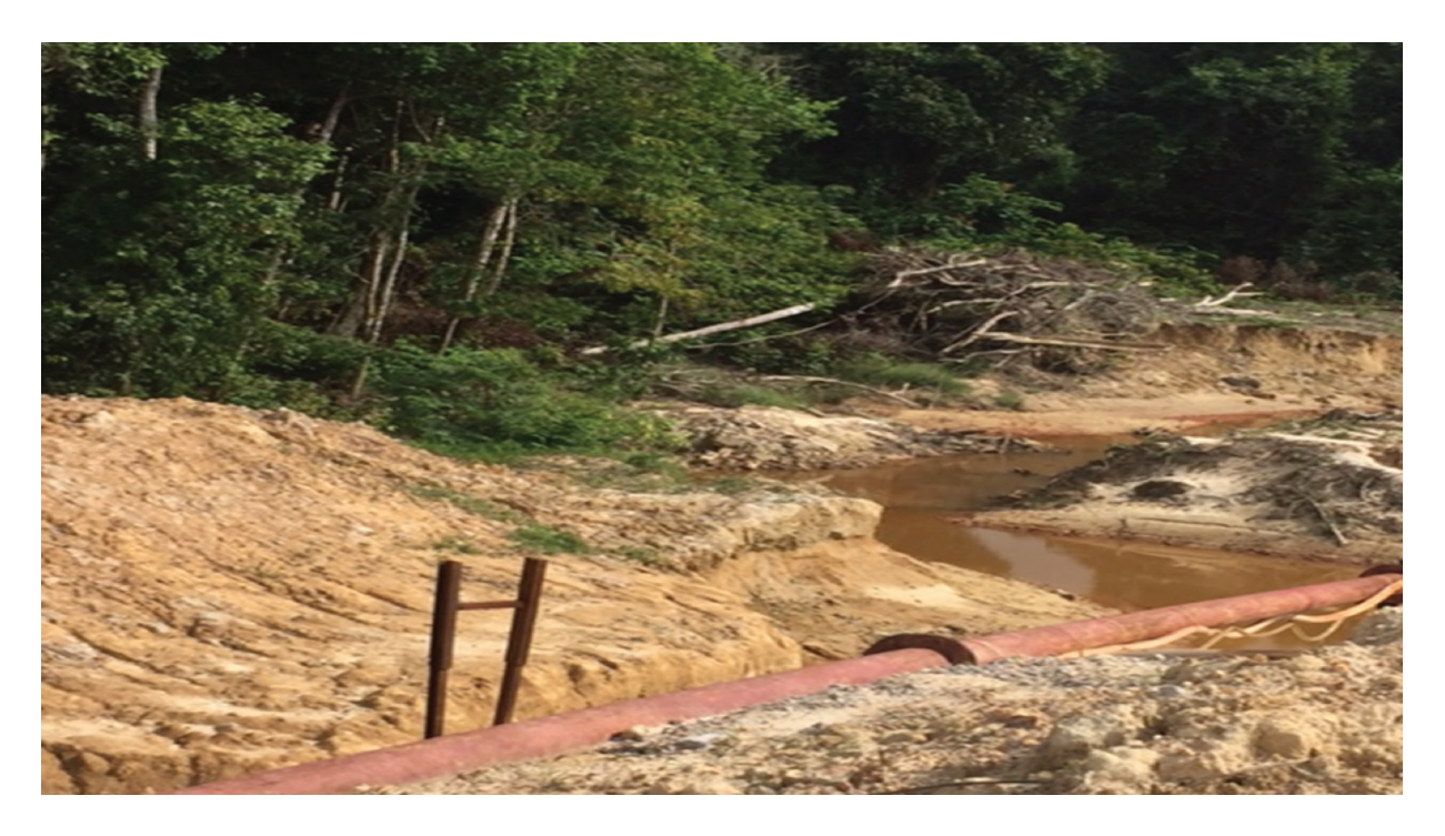
Figure 7: Water from the pond were discharged into Sungai Taweh and Sungai Riau