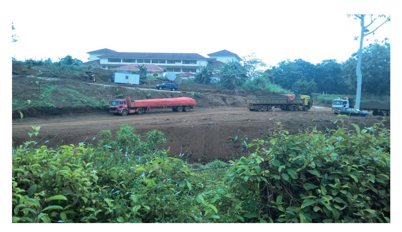
Figure 2: Mining activities occurring close to school area