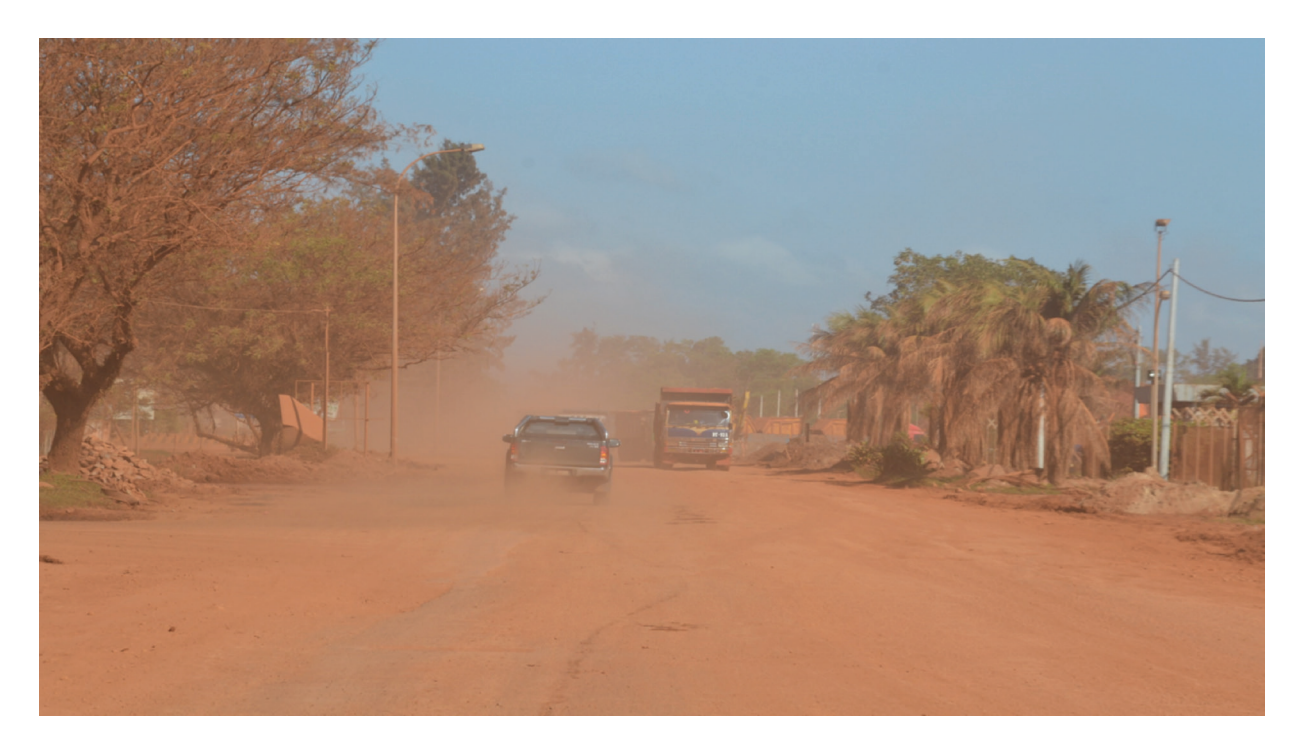
Figure 5: Road stretch toward Kuantan Port heavily covered by dark red dust