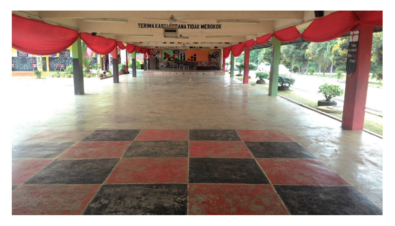
Figure 3: Dust deposited on floor of the school