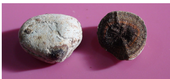
Figure 3: Mixed gallstone.

Cholesterol was present in 38 (82.6%) stones; it was more frequent in females ( n = 24 , 63.2%, 95% CI 46.0–78.2) than in males ( P < 0.001 ). The incidence of bilirubin-containing stones ( n = 12 , 26.1%) was slightly higher in males ( n = 7 , 58.3%) than in females ( n = 5 , 41.7%). However, this was not statistically significant ( P = 0.240 ). The triglycerides were seen only in cholesterol and bilirubin mixed calculi.