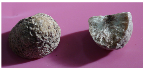
Figure 2: Cholesterol gallstone.