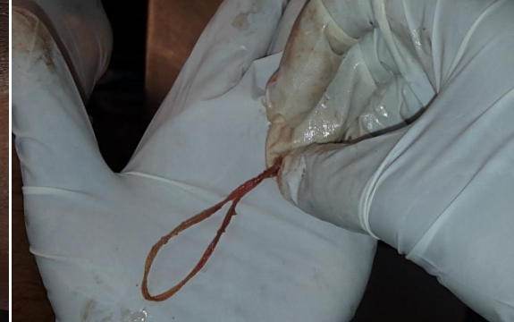
Fig 5: Would after 15 days. Wound is healing, Healthy granulation tissue present. Sero "sanguineous discharge" was present.