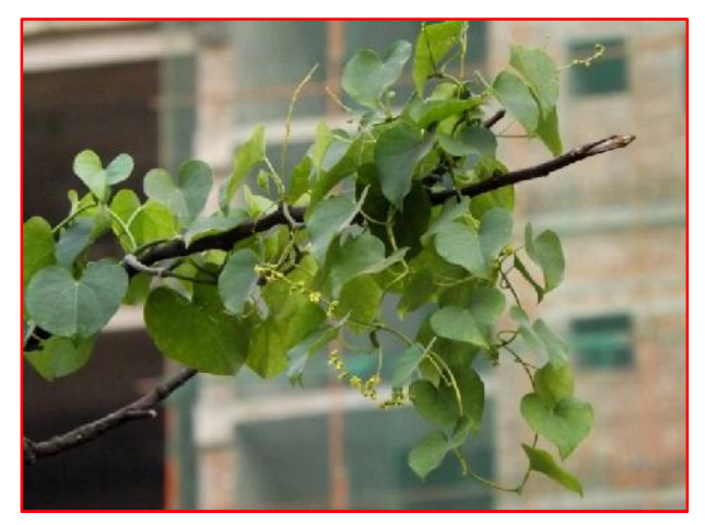
Fig No.1 T. Cordifolia climber