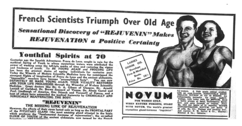
Figure 3: "French Scientists Triumph Over Old Age: Rejuvenin" advertisement in India Illustrated Weekly Calcutta, 1938 (Anon. 1938g).

mass produces a variety of rasāyana compounds from its headquarters in Kottakkal.<sup>95</sup> Indigenous medicines were seeing something of a revival in respect or at least acknowledgement of a continued usefulness, particularly highlighted by the patronage of nationalist figures such as Malaviya.